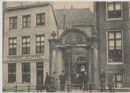
Oudemanshuispoort, c. 1900