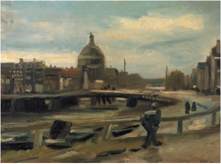
Vincent van Gogh, View of Amsterdam , 1885 Collection P. and N. de Boer Foundation, Amsterdam

When Vincent came to Amsterdam in 1885 to visit the Rijksmuseum, he painted two cityscapes from the temporary train station. The present Central Station was just being built then. The view in this painting is still recognisable. Hear more about it in the audio stop.