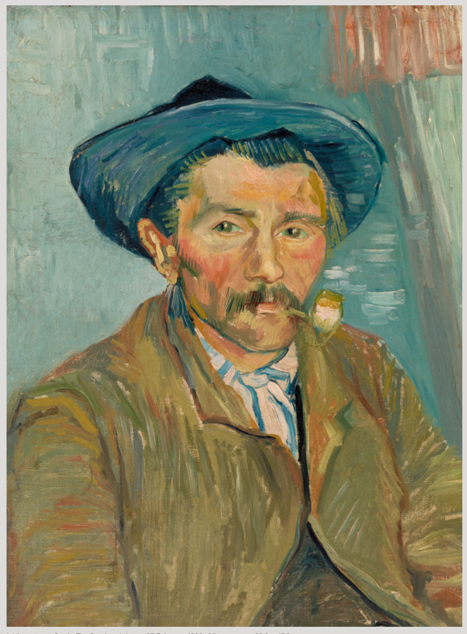
1. Vincent van Gogh, The Smoker . Arles, c. 27 February 1888. Oil on canvas, 62.9 x 47.6 cm. The Barnes Foundation, Philadelphia, F 534 JH 1651