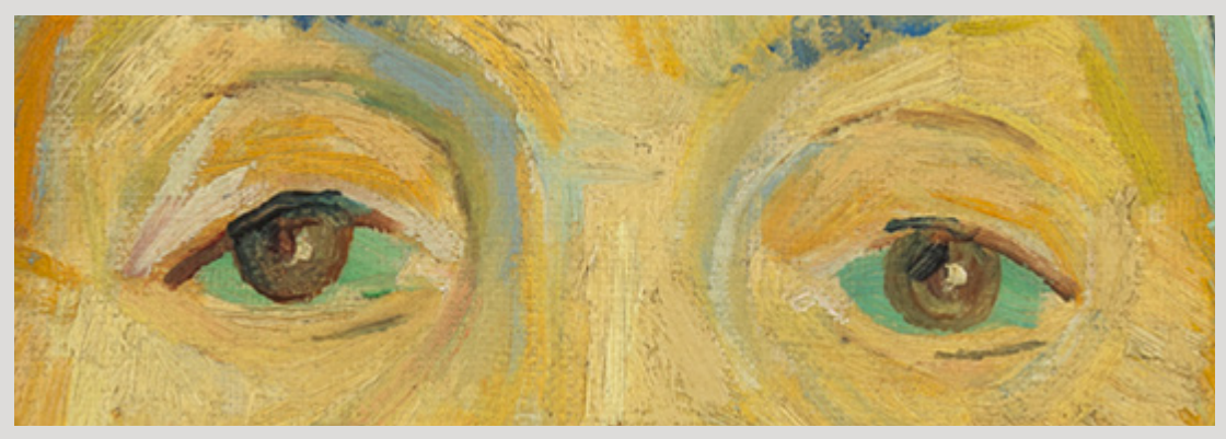
6. Comparison of the eyes