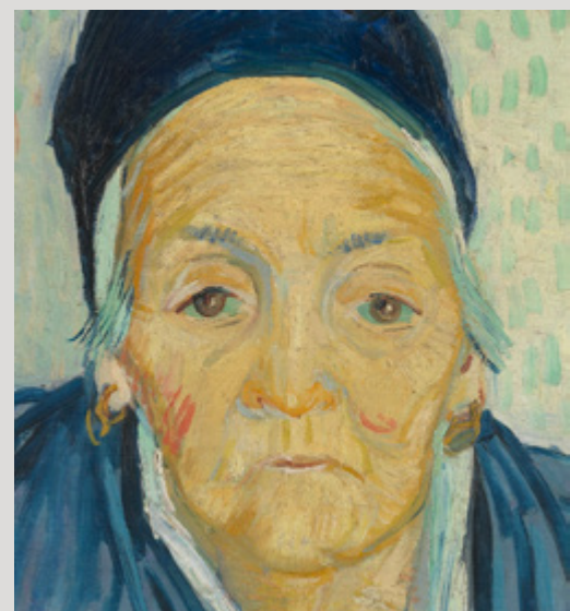
5. The Smoker (detail) and An Old Woman of Arles (detail)