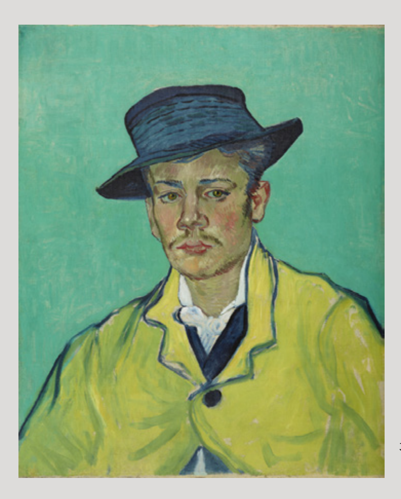
3. Vincent van Gogh, Portrait of Armand Roulin . Arles, November-December 1888. Oil on canvas, 65 x 54.1 cm Museum Folkwang, Essen, F 492 JH 1642