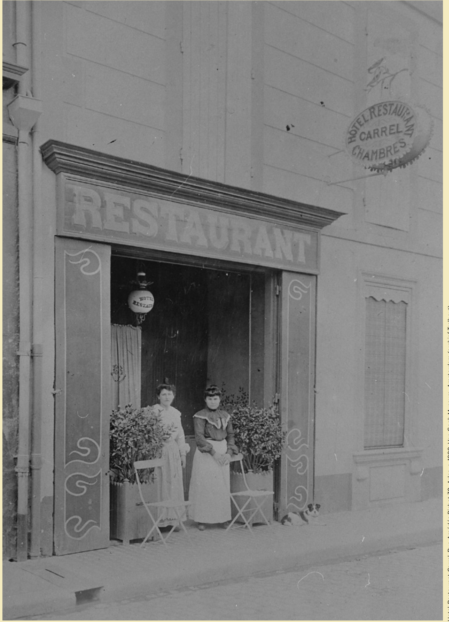
Hotel-Restaurant Carrel, Rue Amédée Pichot 30, Arles, c. 1900. Van Gogh Museum, Amsterdam (archief Tralbaut)