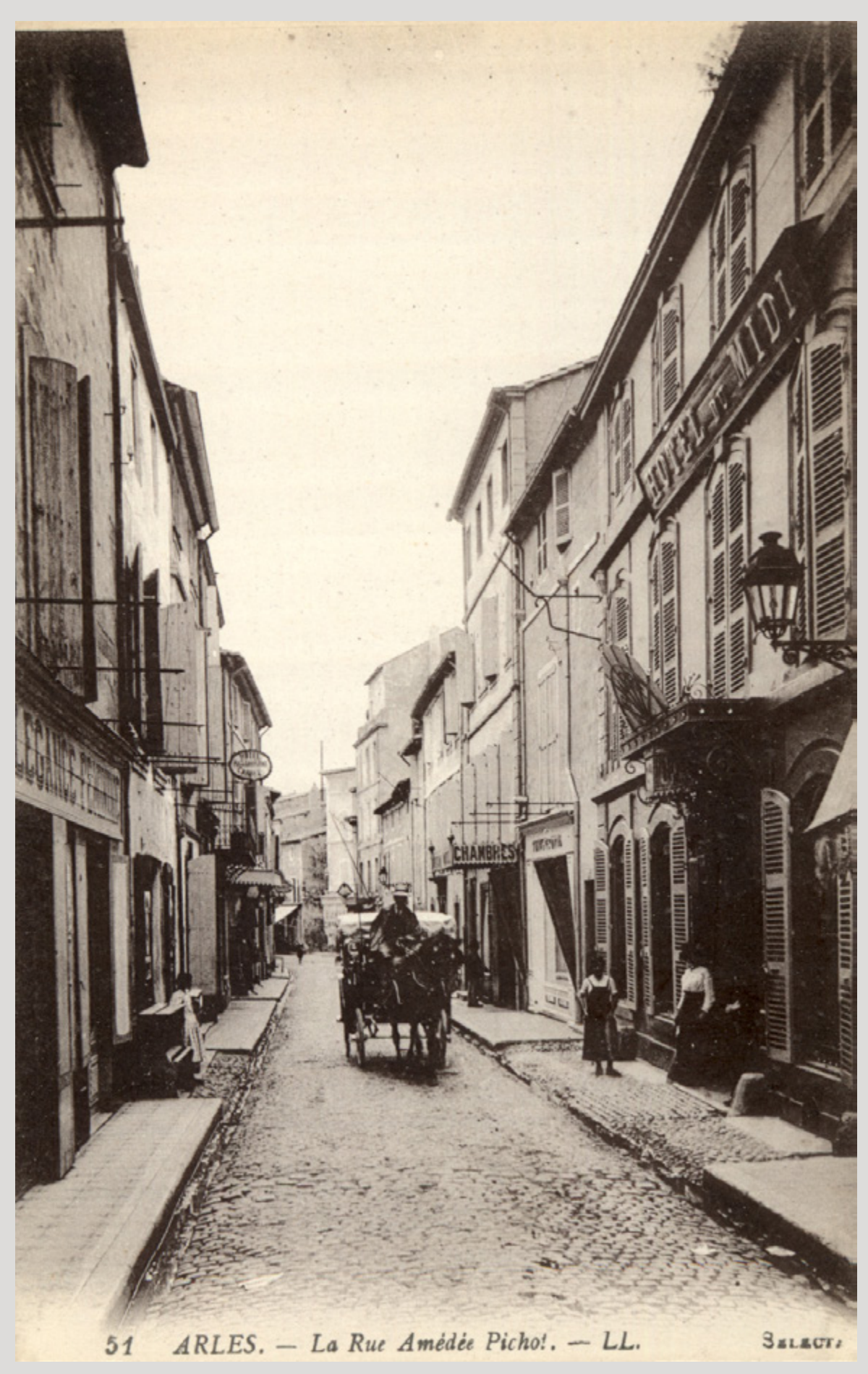
Rue Amédée Pichot, Arles, c. 1905 - postcard. Hotel-restaurant Carrel left of the horse and carriage.