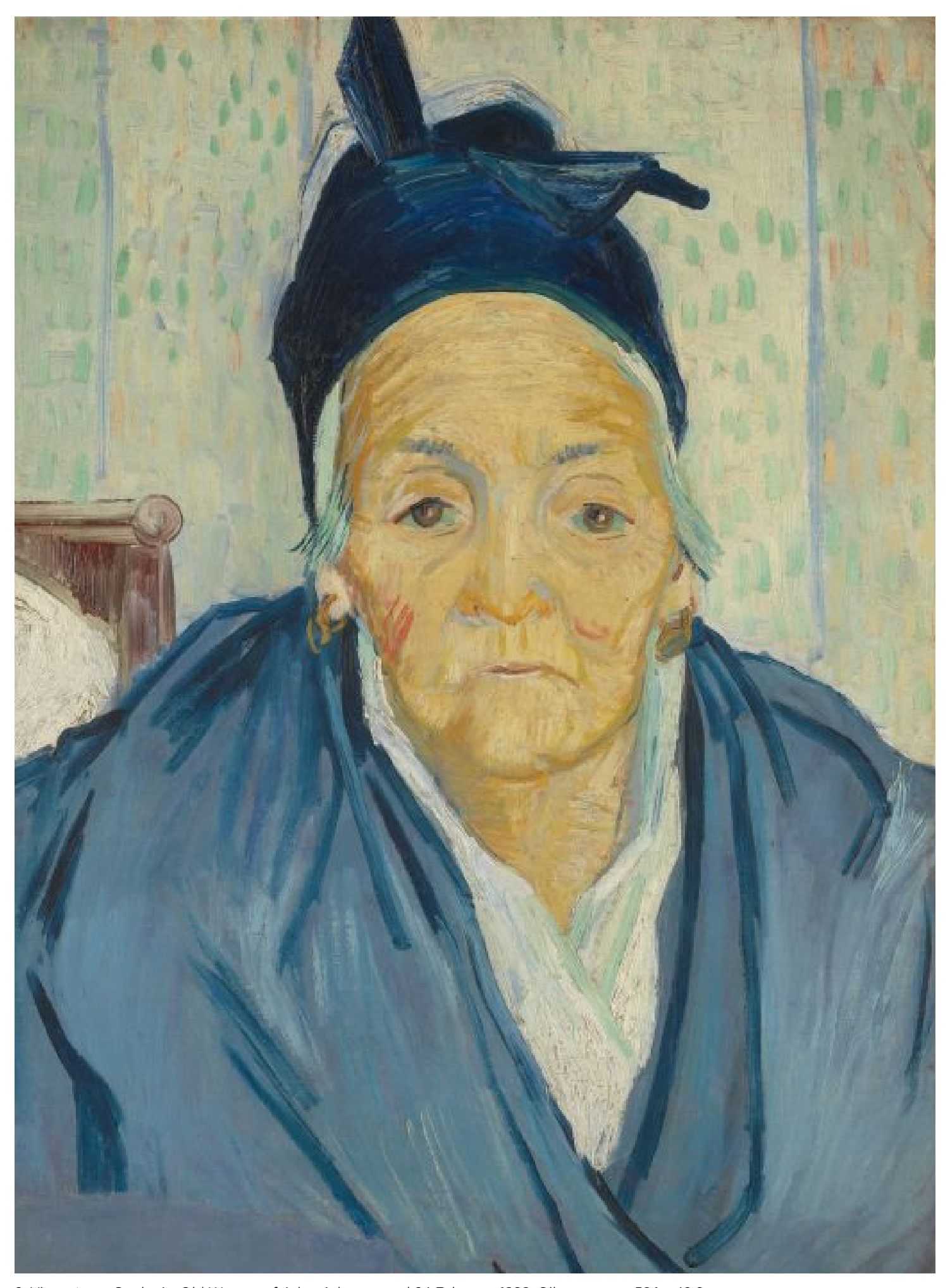
2. Vincent van Gogh, An Old Woman of Arles . Arles, around 24 February 1888. Oil on canvas, 58.1 x 42.6 cm. Van Gogh Museum, Amsterdam (Vincent van Gogh Foundation), F 390 JH 1357